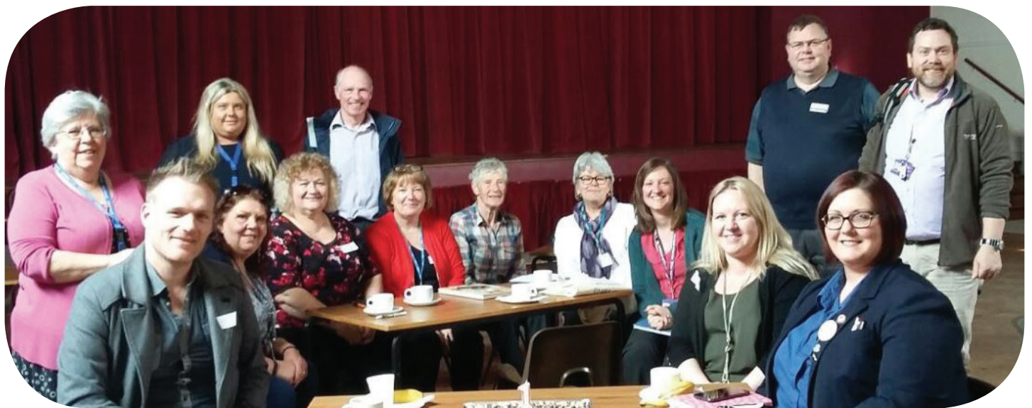
Community Development Workers Network Meeting

So what have Healthy Fenland helped to get started?