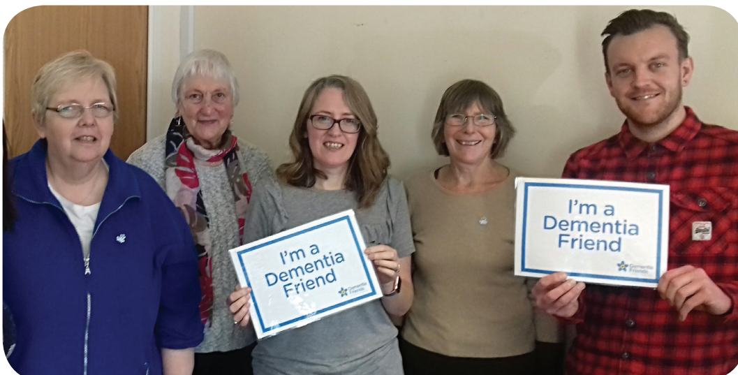
Dementia Friends after their Training